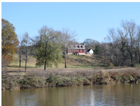
GEORGE WASHINGTON'S FERRY FARM

Pricing for onsite programs is as follows: